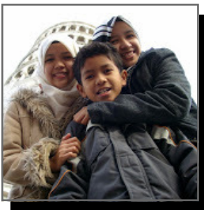
Pisa, Italy (2007).

The long PhD voyage has taught me a lot about life and people. A PhD should not make you feel cleverer, but it should make you realize how little you know and that feeling should make you desire for more. It should open up your thirst for knowledge and help you to be more vigilant with information. It is not the end result that counts; it is what you have become that matters. Indeed, "the voyage of discovery consists not only in seeking new lands, but seeing with new eyes" – Marcel Proust.