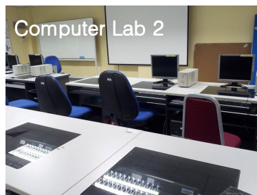
Computer Lab 2

Students are also invited to use Computer Lab 2 at Block B7 whenever it is free. This room is temporary used for graduate classes.